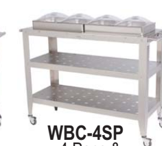
WBC-4SP 4 Pans & 4 Individual Lids